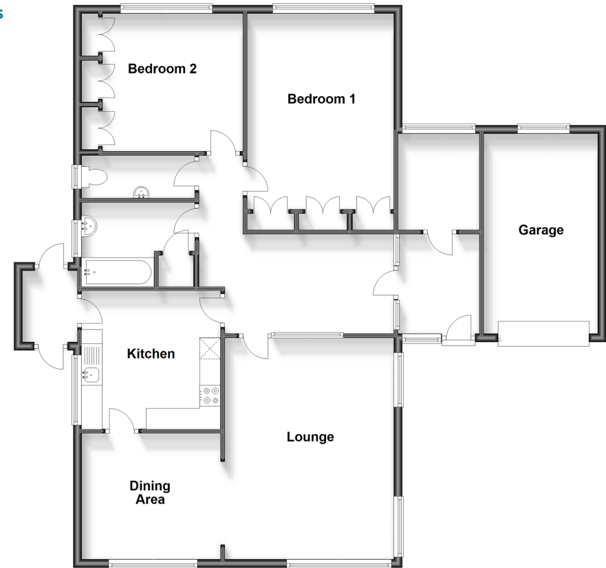
Ground Floor Approx. 124.7 sq. metres (1342.7 sq. feet)

Call Ventnor - 01983 856417 ■ pittis.co.uk