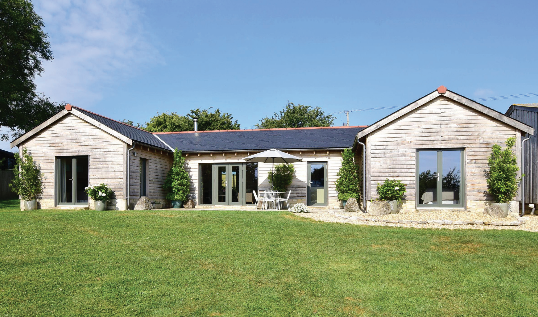
Appletree Barn Appleford Lane | Whitwell | Isle of Wight | PO38 2PH