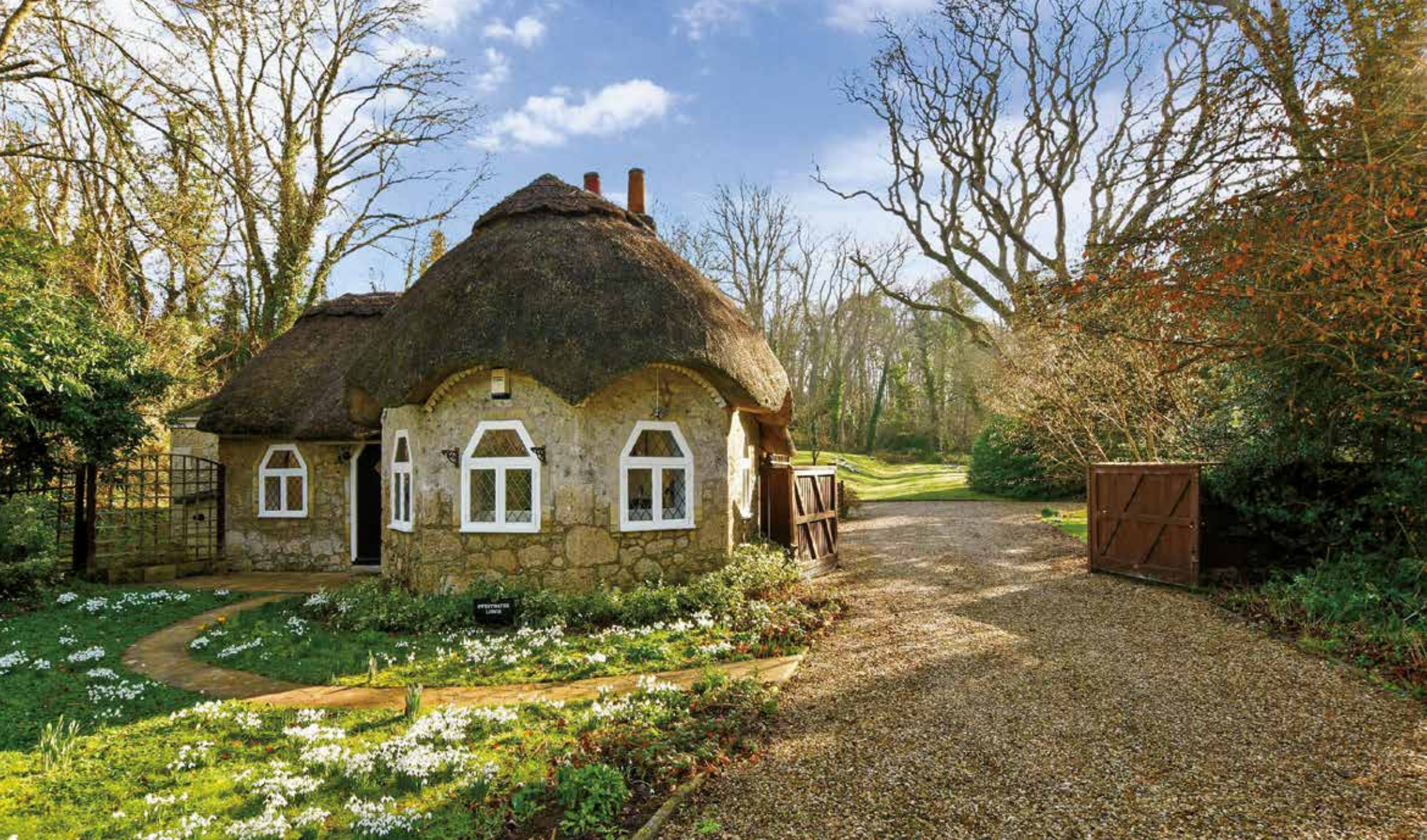
Sweetwater Lodge Westover | Calbourne | Isle of Wight | PO30 4JN